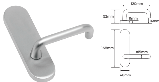
503AV - External plain plate