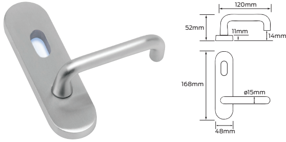
502AV - External plate with cylinder hole