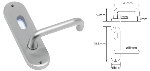
511AV - Internal plate with cylinder hole