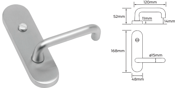
504AV - External plate with emergency release