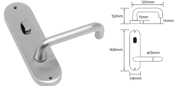
514AV - Internal plate with turn